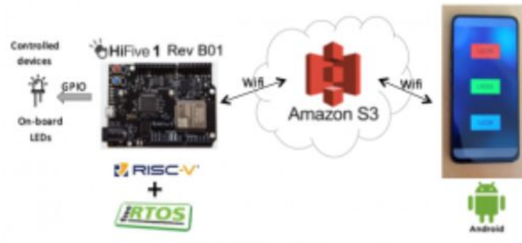
Figure 1: HiFive1 Rev B with Amazon S3 demonstration