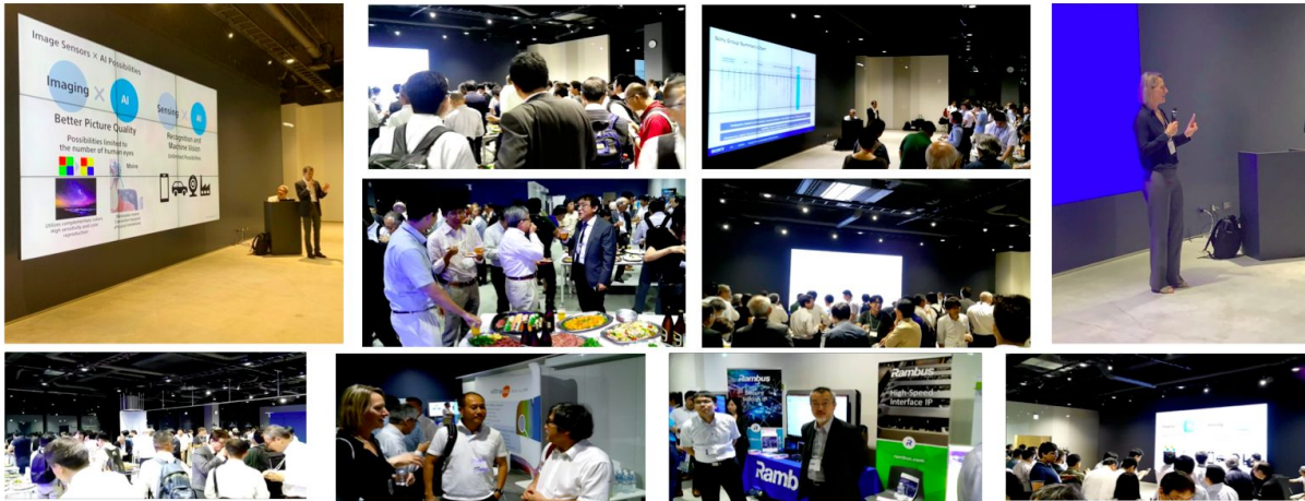
RISC-V Day Tokyo 2019 September 30, 2019

RISC-V Day 2019 was held at Hitachi, Ltd. Central Research Laboratory Baba Memorial Hall on September 30, 2019 with a capacity of 360 people.