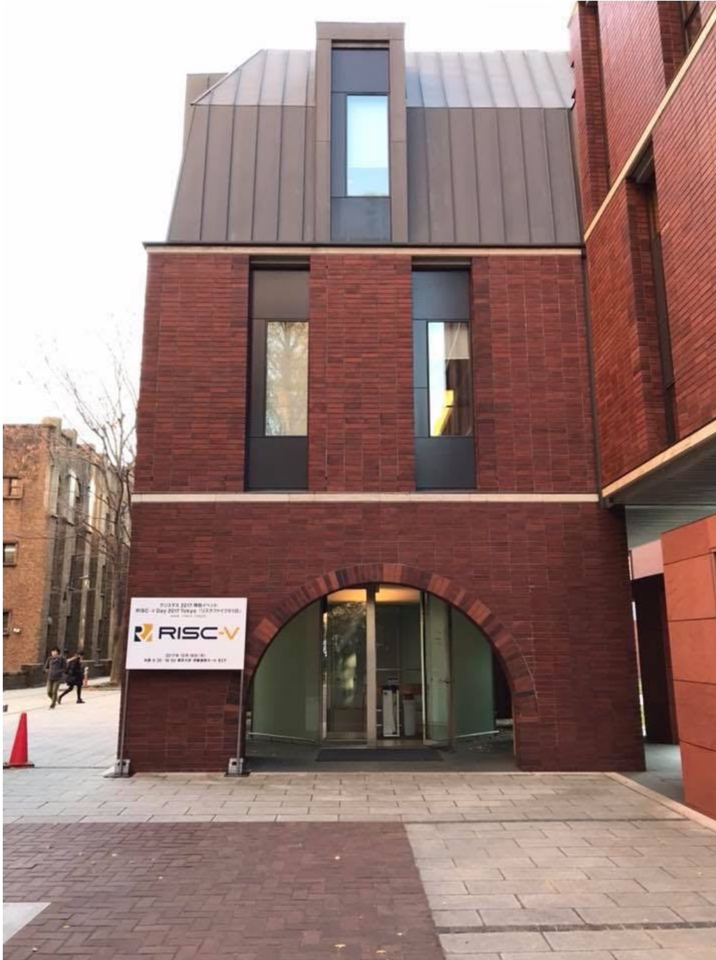
Fig.1 Ito International Research Center of The University of Tokyo (RISC-V Day Tokyo 2017/12/18 )