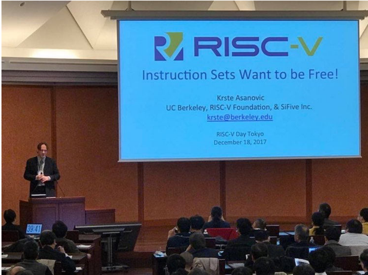
Fig. 2 Presentation scene at Ito Hall (RISC-V Day Tokyo 2017/12/18 )