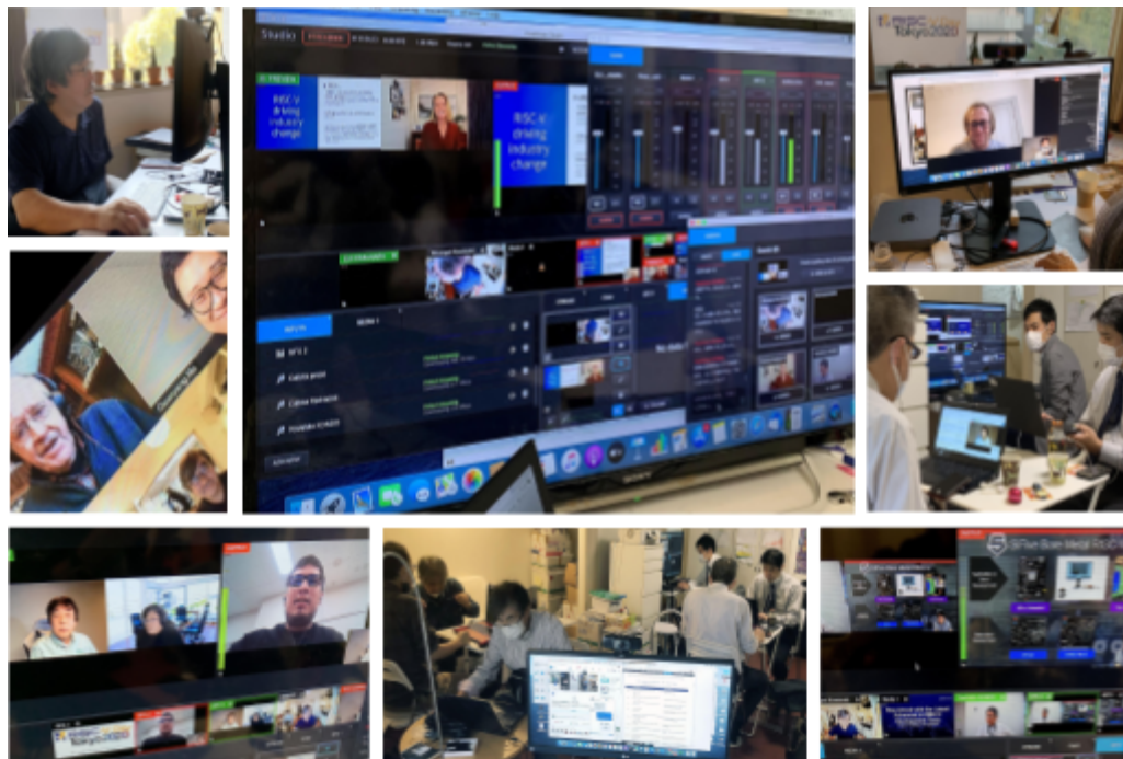
Fig. 2 On-Premise Studio Views (RISC-V Days Tokyo 2020 11/5-6)